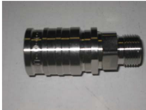
Fig. 1 Quick coupler female part.

With the liquid cooled types in frame Size E and F(69), two (2) quick coupling female parts, see Figure 1 below, are part of the delivery. These quick coupling parts are required for connecting the liquid cooling system of the frame Size E and F(69) type of units with the external cooling system.